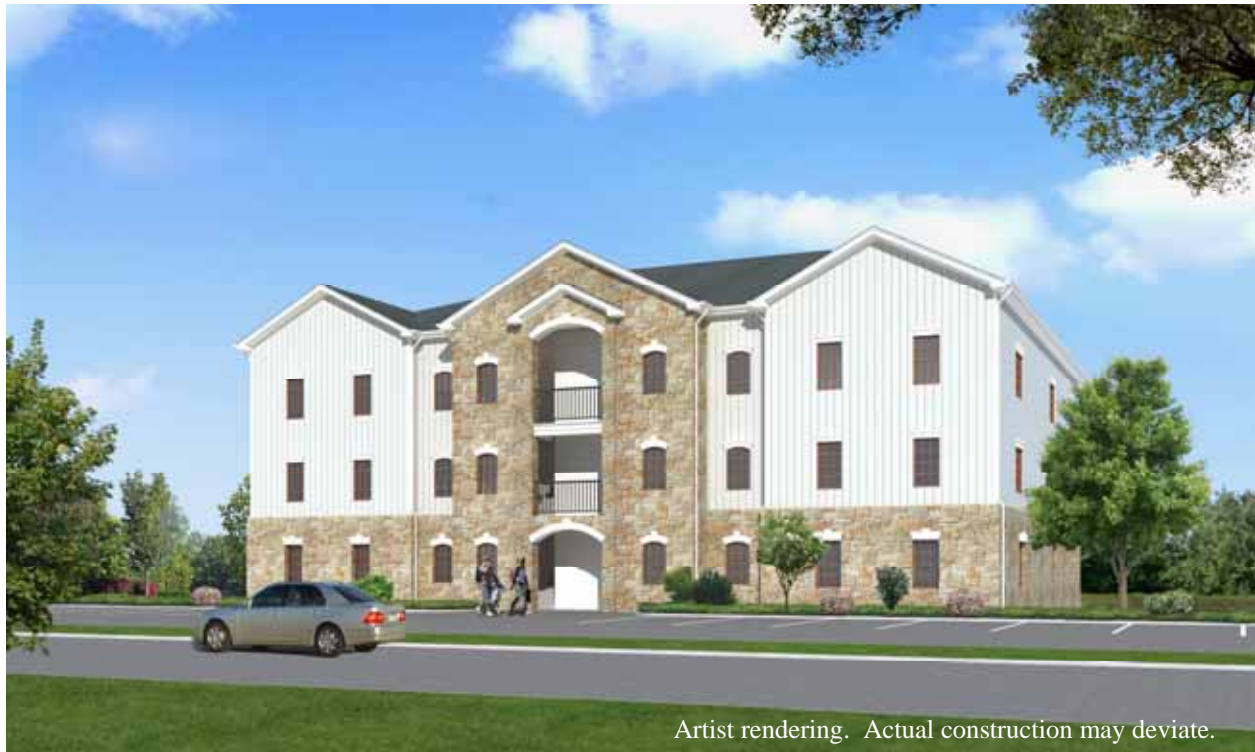
Artist rendering. Actual construction may deviate.